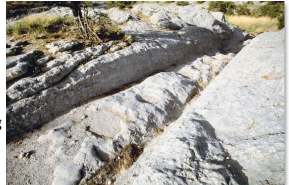
Ruts are still visible today on the Oregon Trail

It has been said that when wagon trains of settlers would gather in Independence, Missouri for the 2,000-mile trek to western Oregon on the Oregon Trail, trail bosses would often tell them to pick their ruts carefully because they were going to be in them for a long time. Of course, that wisdom applies to so much more than the Oregon Trail. We like our ruts because human beings are creatures of habit. I was interviewing at a church one time, and as congregations generally do, they asked me to bring the morning message. Well, that is an uncomfortable thing for a pastor because we like to tailor messages for people we know, or, at least, are getting to know. So, I tried an experiment with this congregation so that they could feel a little bit of discomfort as well. I asked the congregation to stand and trade sides of the sanctuary. If they were on the left they should go to the right, if on the right they should sit on the left. A little thing, right? Oh no... not little at all. You could sense the grumbling and groaning, and though it wasn't out loud, there were several who refused to give up "their" seat. That should have been a clue.